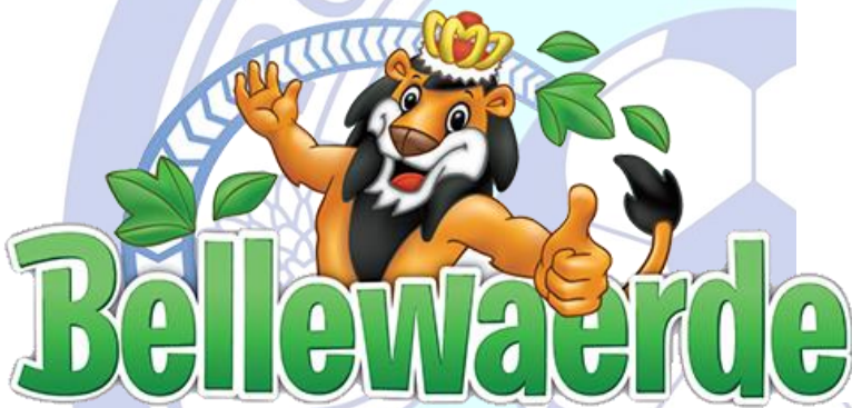
Amusement park Bellewaerde (Ypres) and Walibi (Wavre) 88 km