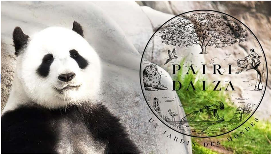
Pairi Daiza 17 km Best Zoo in Europe in 2018