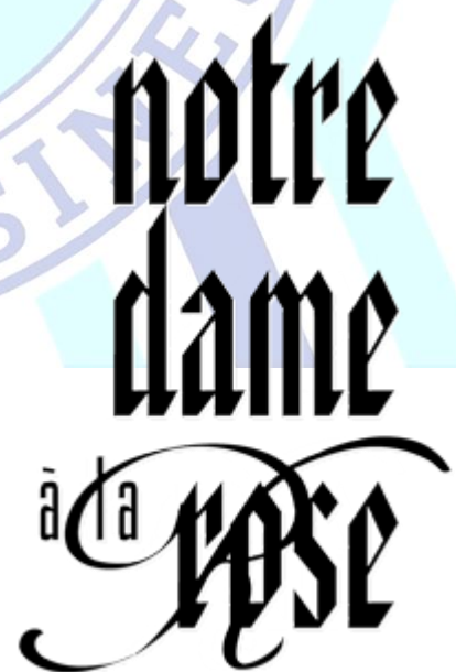
Notre Dame à la Rose 5 km