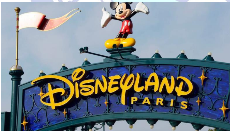
Amusement park Disneyland Paris 290 km